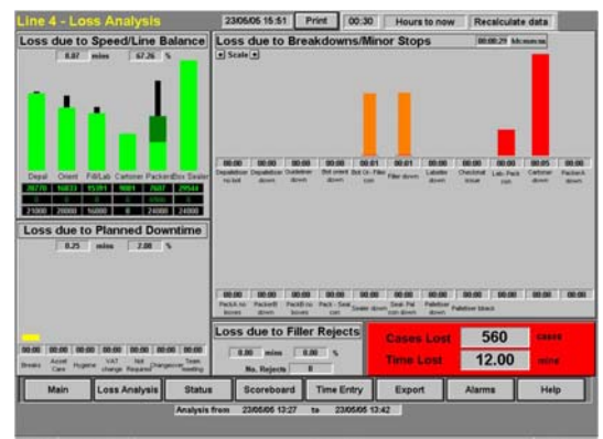
Loss Analysis screen

TO FIND OUT MORE LOG ONTO: www.freelineview.com