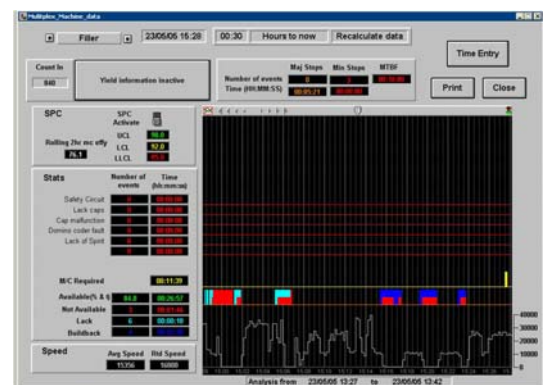
Machine Faults/SPC screen