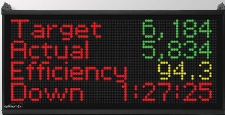
XL800 Size: 35cm (h) x 67cm (w) x 9cm (d), 9kg

XL800 is an easy to install and complete solution that will help you achieve all of these objectives.